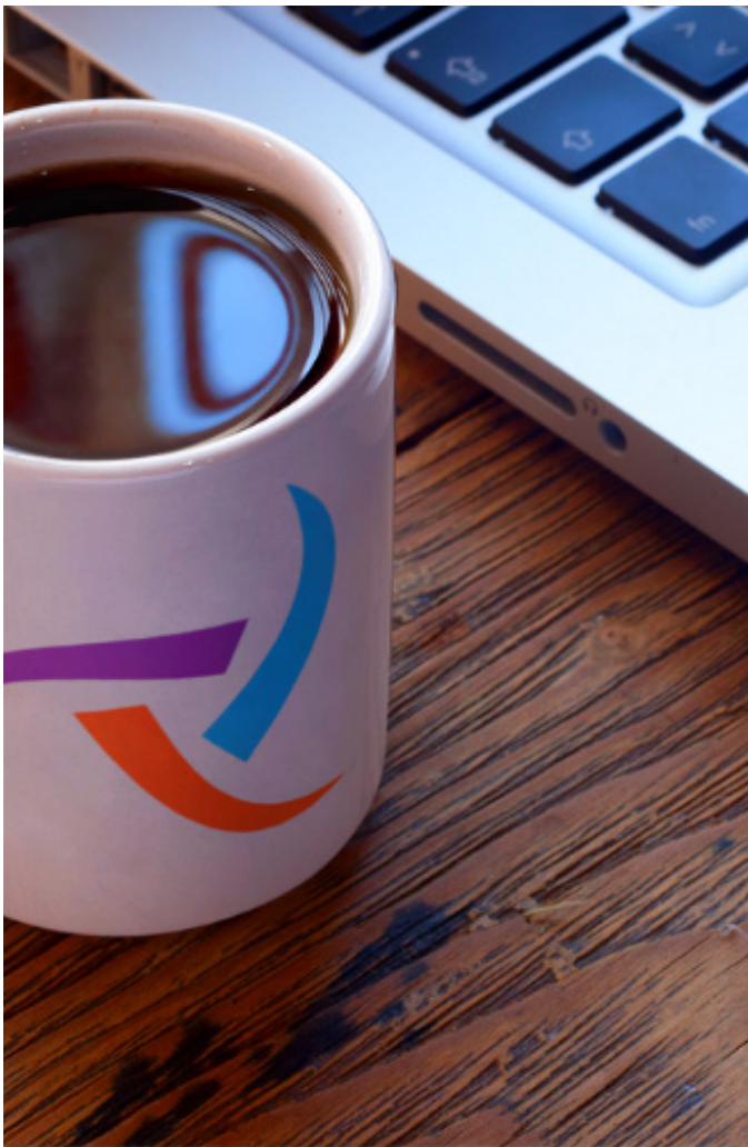
Sage Intacct's powerful project accounting software helps the team painlessly.